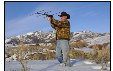
Bird on ground

Hint: If both horizontal and vertical signals can be heard, use horizontal for better pinpoint accuracy.