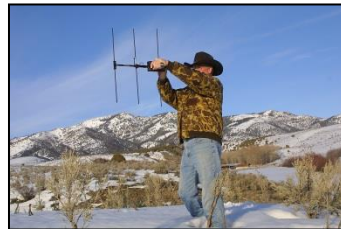
Bird on perch

Signal from Turbo is strongest if receiver antenna is lined up in same orientation as Turbo antenna . Since a falcon on a perch keeps tail almost vertical, you will get best signal if holding receiver antenna with its elements vertical. However, there are cases when transmitter's antenna could be nearly horizontal and holding your receiver antenna horizontally will give the better result.