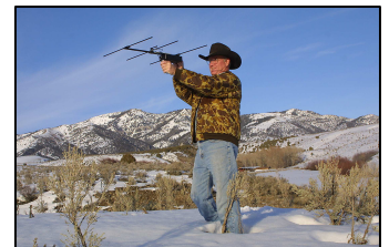
Bird on ground

Hint: If both horizontal and vertical signals can be heard, use horizontal for better pinpoint accuracy.