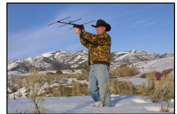
Bird on ground

Hint: If both horizontal and vertical signals can be heard, use horizontal for better pinpoint accuracy