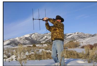
Bird on perch

Signal from a transmitter is strongest if receiver antenna is lined up in same orientation as transmitter antenna . Since a falcon on a perch keeps tail almost vertical, you will get best signal if holding receiver antenna with its elements vertical. However, there are cases when transmitter's antenna could be nearly horizontal and holding your receiver antenna horizontally will give the better result.