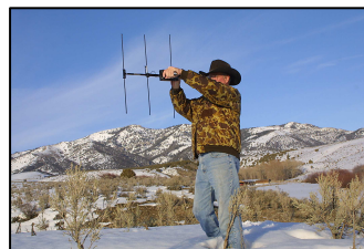
Bird on perch

Signal from Scout is strongest if receiver antenna is lined up in same orientation as Scout antenna . Since a falcon on a perch keeps tail almost vertical, you will get best signal if holding receiver antenna with its elements vertical. However, there are cases when transmitter's antenna could be nearly horizontal and holding your receiver antenna horizontally will give the better result.