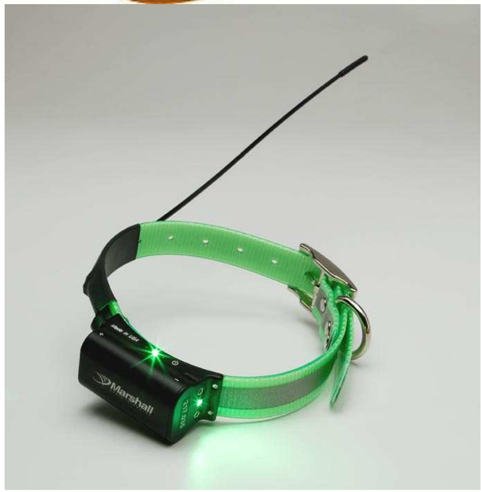
With High Intensity Safety Lights